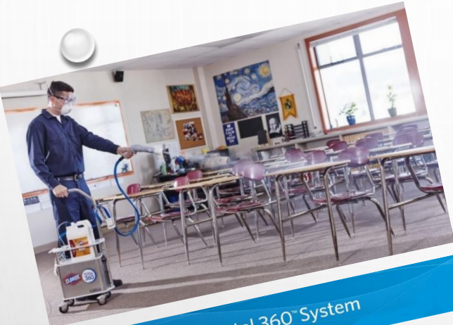
Clorox TOTAL 360 Clorox® Total 360™ System