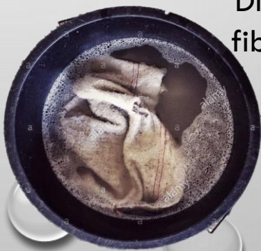
Dirty Rag to micro fiber table top kits