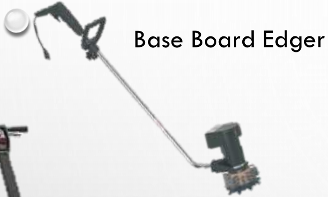
Base Board Edger