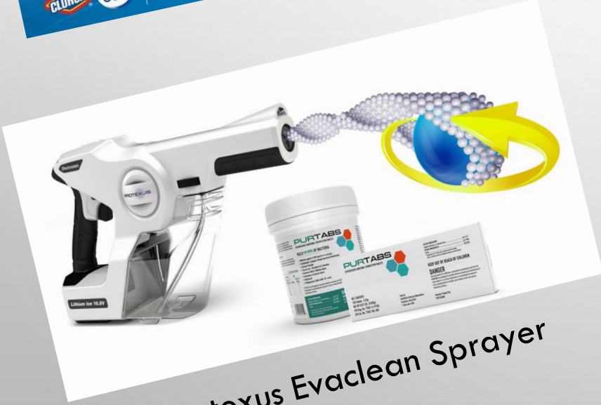
Protexus Evaclean Sprayer