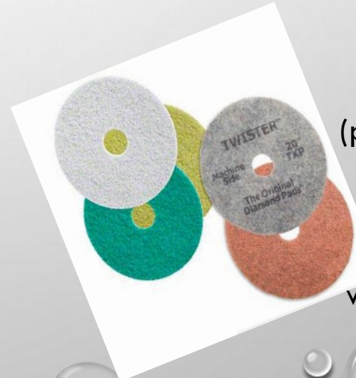
Twister and Intelli Pads (pads saturated with micro diamonds. Polish & clean w/o chemicals)