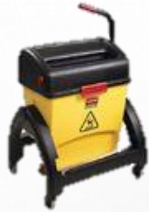
Hygienic mopping system