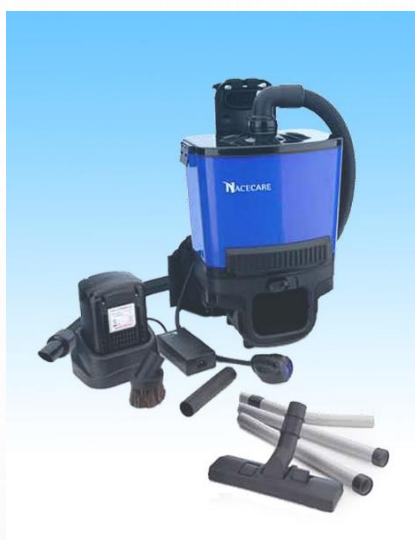
Cordless Back-Pack and Uprights