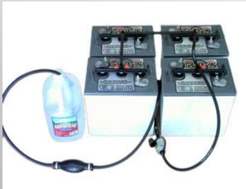
Hydro Link battery filling system