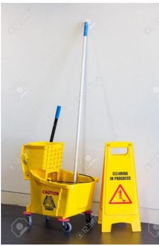
Traditional mopping system