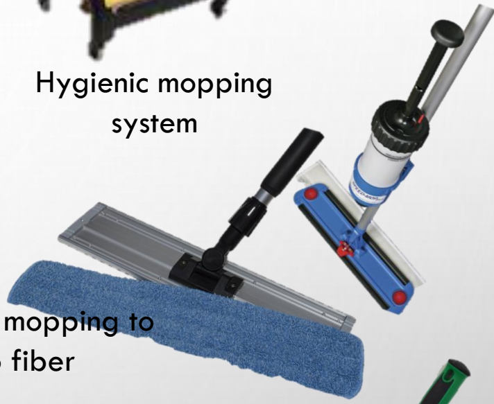
Traditional mopping to micro fiber