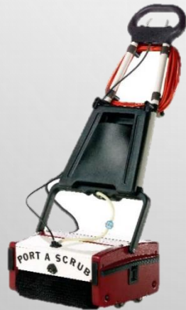
Port A Scrub