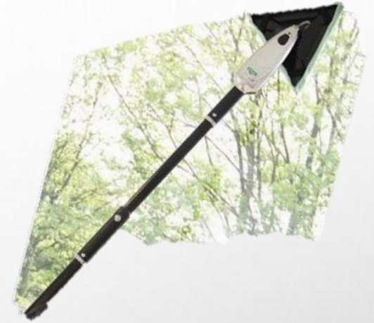
Stingray window cleaning kit