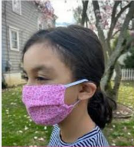
Child Size Face Mask